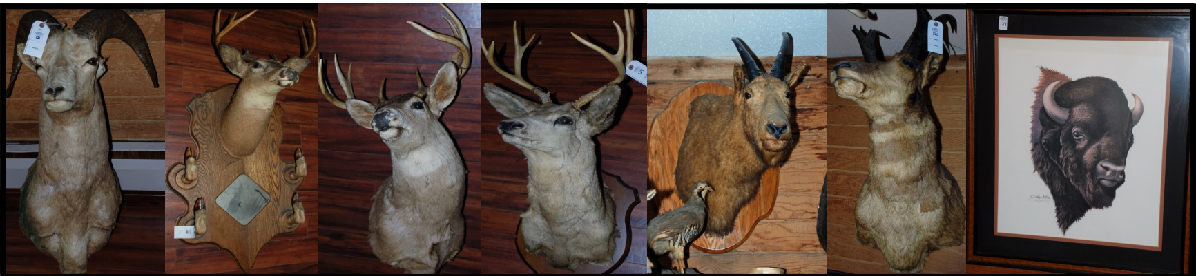
Lot 121–Dall Sheep Lot 122–Coat Rack Lot 123–Chelsea Buck Lot 124–Mule Deer Lot 125–Mountain Goat Lot 126–Antelope Lot 127–Litho by Harry Antis