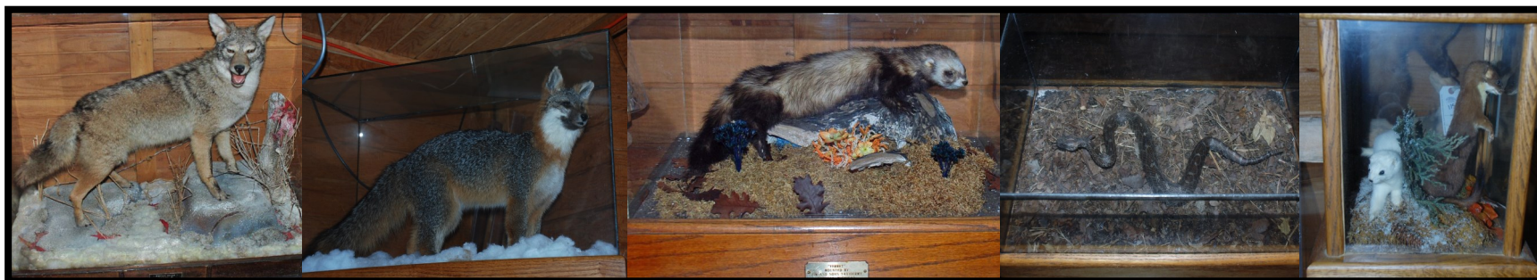
Lot 110– Coyote (Very Fine) Lot 111– Fox (The very Best) Lot 112–Ferret in Custom Case Lot 113–Mississauga Rattler Lot 114–Albino Ferret