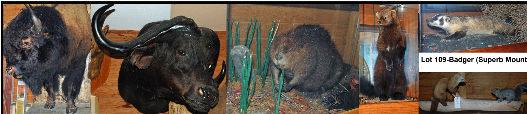
Lot 105– Bison Bull Lot 106– Water Buffalo Lot 107–Beaver (Superb Mount) Lot 108–Fisher Lot 109–Badger (Superb Mount) Lot 115– Pine Marten & Squirrel