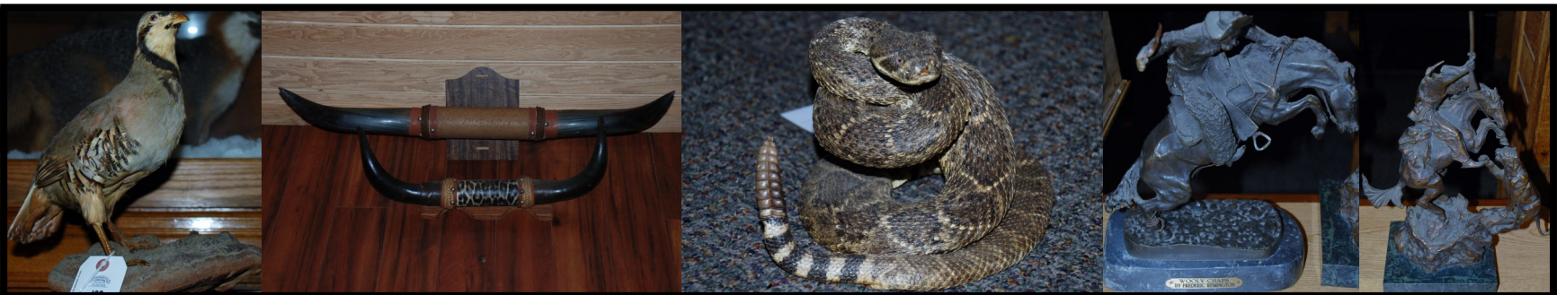
Lot 128–Partridge Lot 129–Longhorns Lot 130–Shorthorns Lot 131–Diamond Back Rattler (Awesome) Lot 132–Remington Lot 133–Remington