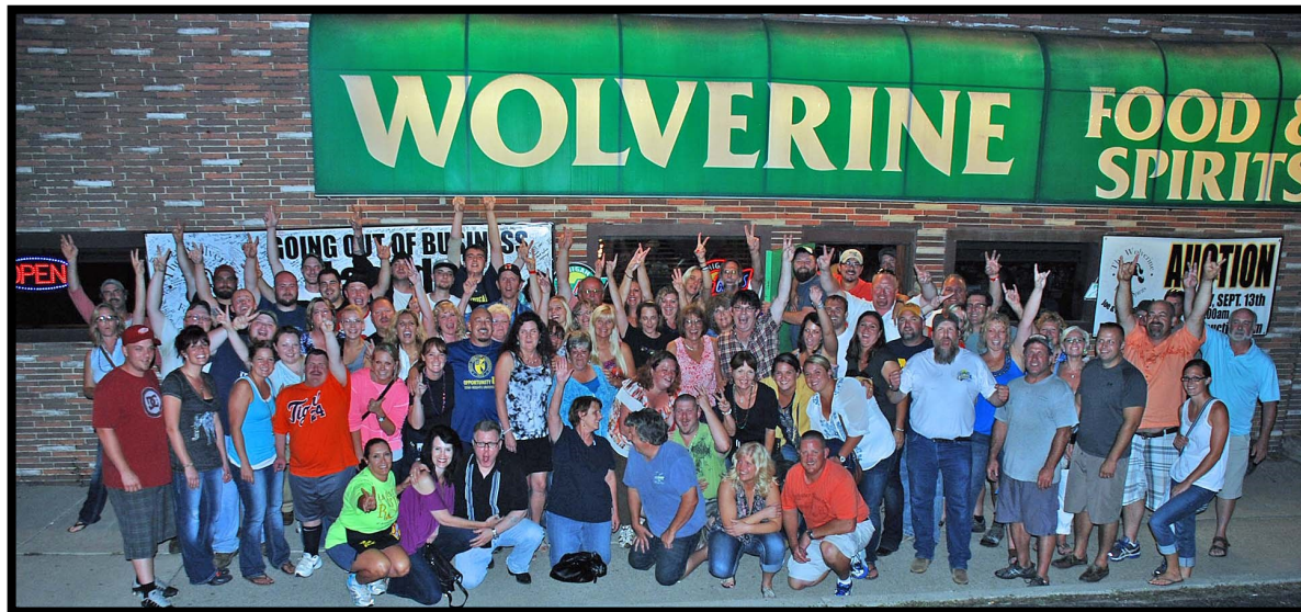
WE LOVE THIS BAR... THANKS FOR THE MANY YEARS OF MEMORIES...