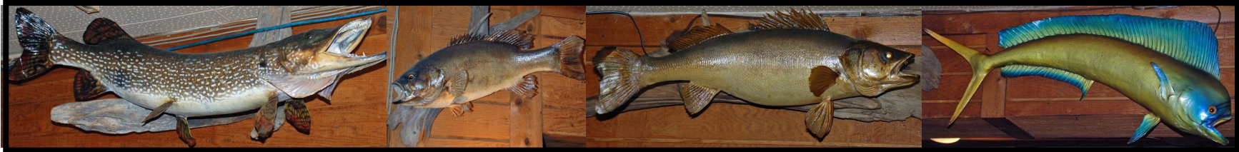
Lot 134—Large Northern Pike (Caught Locally)