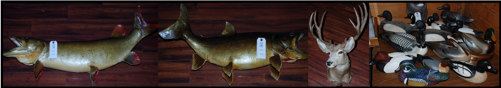
Lot 138—Northern Canadian Pike