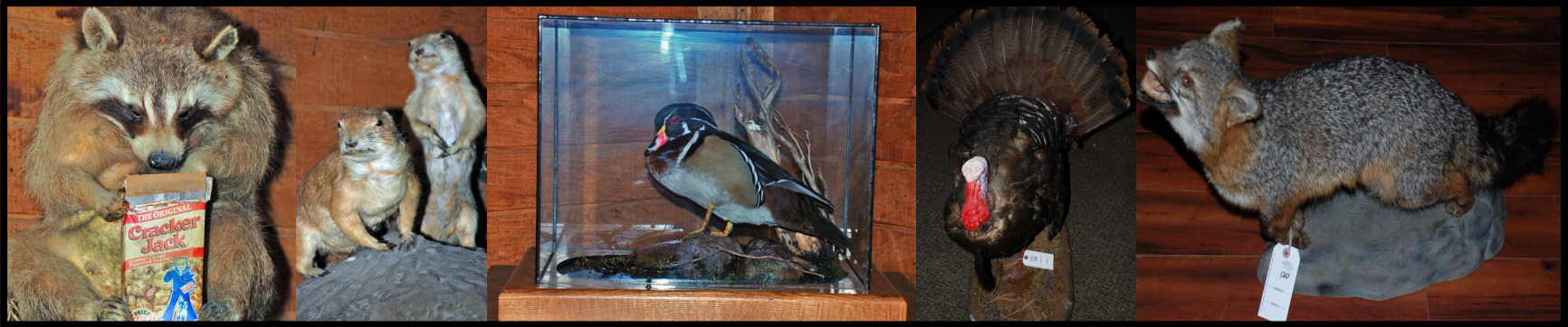
Lot 116– Thieving Raccoon Lot 117– Prairie Dogs Lot 118–Presentation Wood Duck Lot 119–Tom Turkey Lot 120–Grey Fox (It's Vicious)