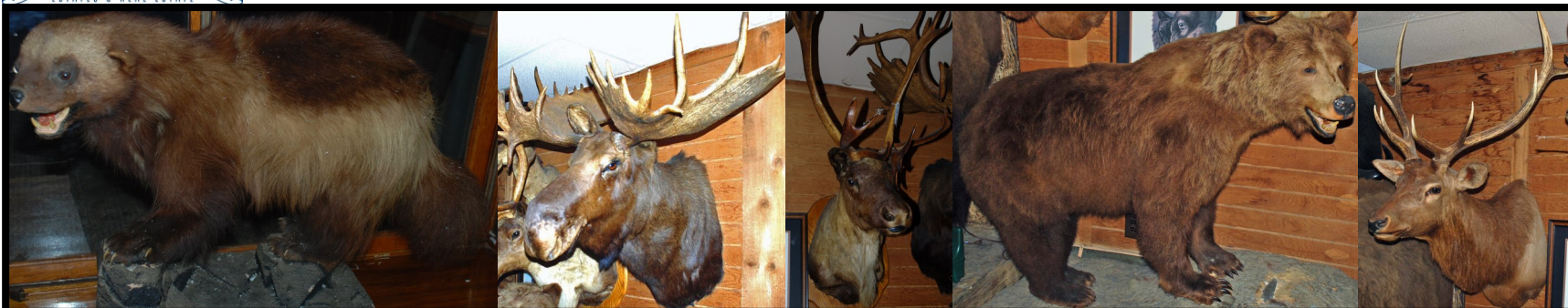
Lot 100– Wolverine in Antique Case (Stunning) Lot 101– Bull Moose Lot 102–Caribou Lot 103–North American Grizzly Bear Lot 104– 5 x 5 Bull Elk